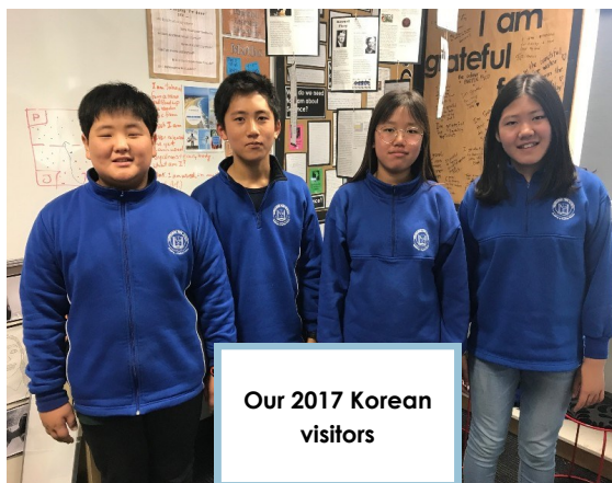
Our 2017 Korean visitors