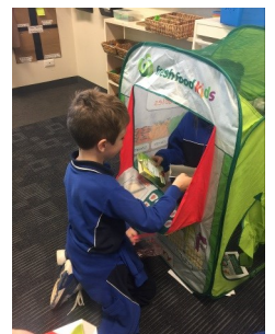
Maths exploration in LC1 and LC2